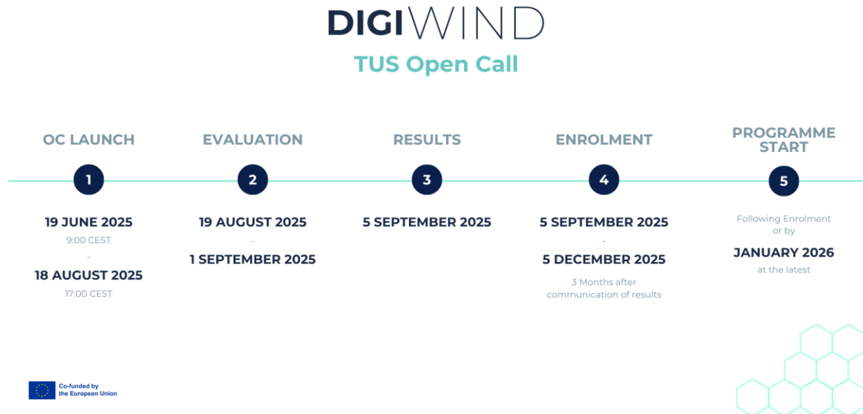
Figure 1. TUS Open Call timeline

Note: While every effort will be made to adhere to these dates, they are indicative and may be subject to change due to unforeseen circumstances or operational needs. Any significant changes will be communicated via the DigiWind website